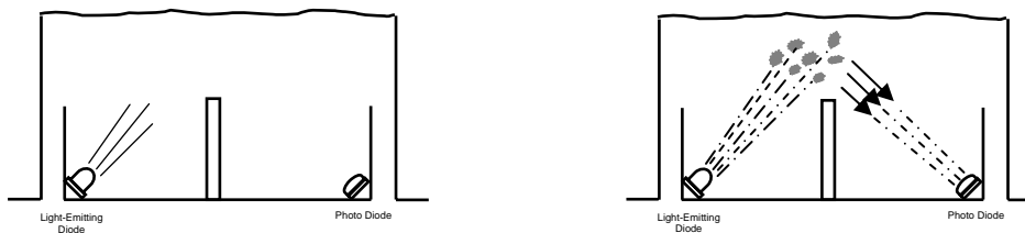
Figure 1. The operation of an optical smoke detector.

4.3.1 Optical smoke alarm (OSA): smoke particles from a burning object enter a dark detection chamber and are there illuminated by a narrow beam of light from a light-emitting diode. The particles scatter the light in all directions and some of the scattered light falls upon a light-sensitive unit (photo diode) which triggers the alarm (see Figure 1).